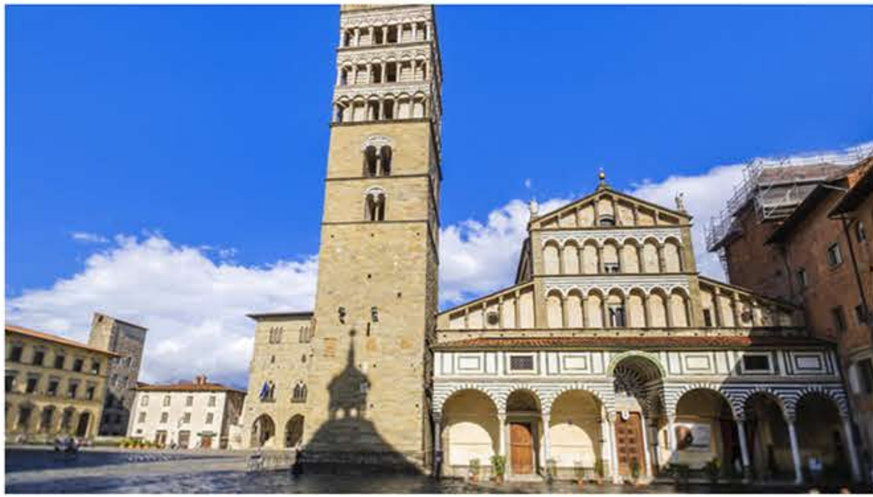
Bell tower and cathedral in the main square of Pistoia, Italy

Pistoia's founding goes back to the ancient Roman Empire, though it had a particularly significant moment in the Middle Ages, when Pistoia gained political independence. The commune had a thriving merchant class and grew prosperous starting in the 12th century. It was also during this time that Pistoia took on the Romanesque architectural distinction that still characterizes it today.