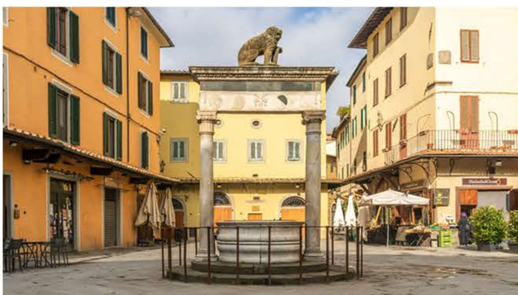
The Piazza della Sala in Pistoia, Italy

Pistoia is a fairly condensed town and highly suited for walking. "Pistoia is a very walkable town — in fact most of the town is pedestrian only, so you don't really have a choice!" travel blog 2 Tiny Travellers shared. The bloggers noted, though, that you can rent e-bikes at the Boundless Life hub, an international co-working hub just a 15-minute walk from the Pistoia train station.