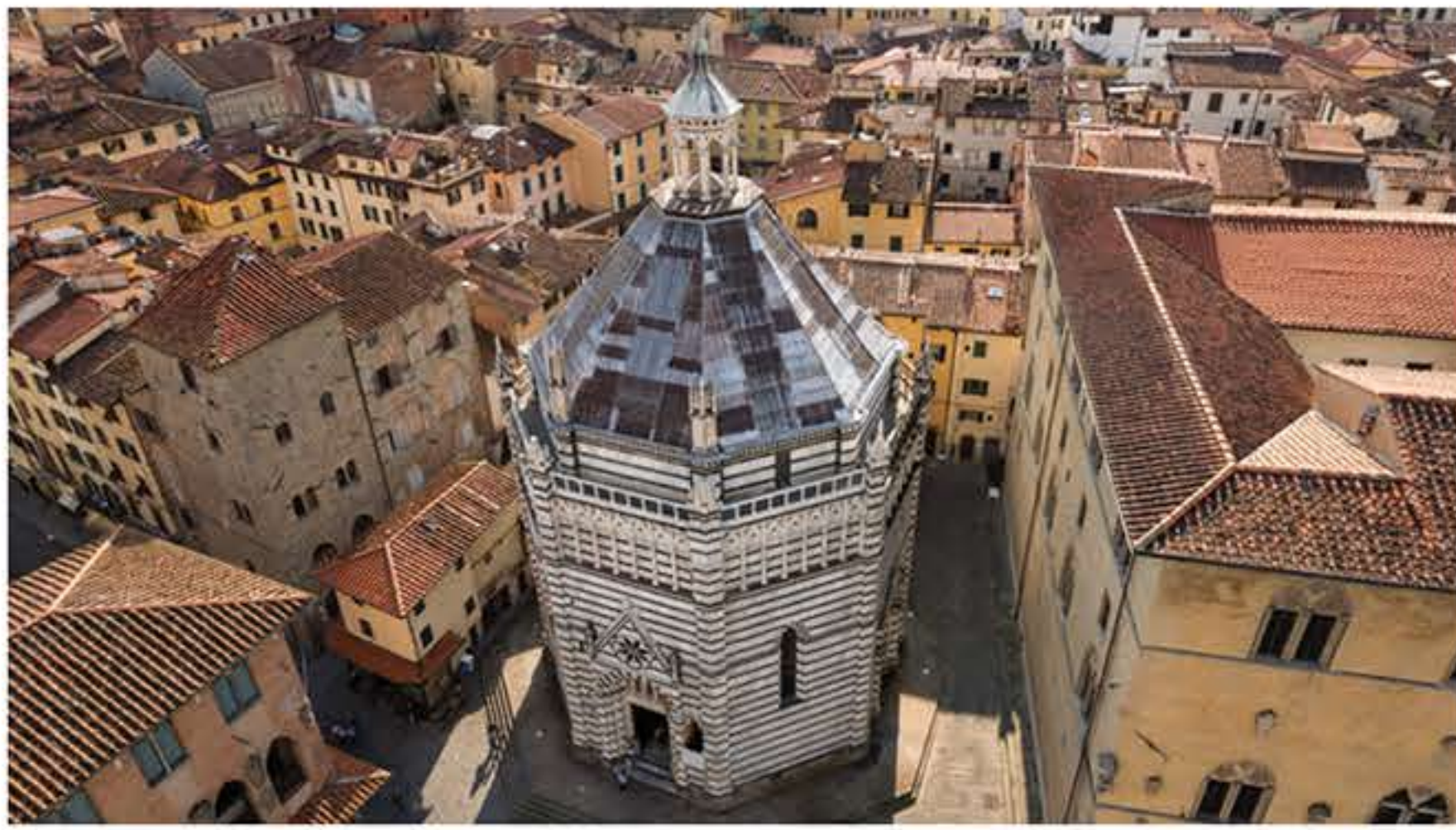
Aerial view of the Battistero di San Giovanni in Pistoia, Italy

Italy's Tuscany region is renowned for its photogenic hilltop towns and for being Italy's best destination for wine lovers . For all its fame and glory, Tuscany is a vast expanse, close to the same size as New Jersey , and it's got plenty of less-touristy destinations scattered among its valleys and vineyards. Pistoia is one of its best, a medieval city of tightly wound streets with 14th-century walls, lively piazzas, and a unique and explorable network of underground tunnels. Plus, it's surrounded by the beautiful, quintessentially Tuscan landscape of lush groves and is even called Italy's " capital of green " for its legacy of nursery gardening.